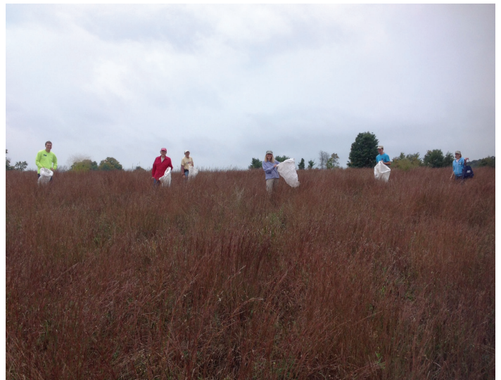
Arcadia Dunes Grassland volunteer seed collection day