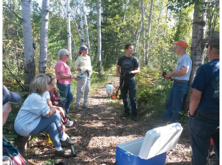
Saint Clair Lake-Six Mile Lake volunteer work day