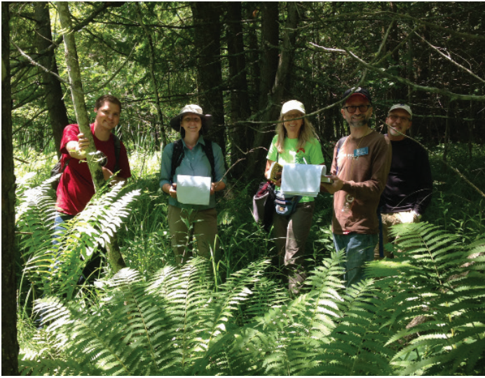
Misty Acres volunteers helping with botanical plant inventory