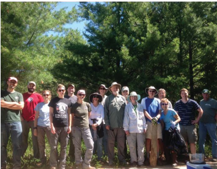
Maple Bay invasive species volunteer work day (thanks AmeriCorps members!)