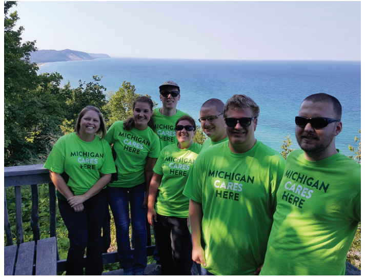
Chemical Bank volunteers at Green Point Dunes.