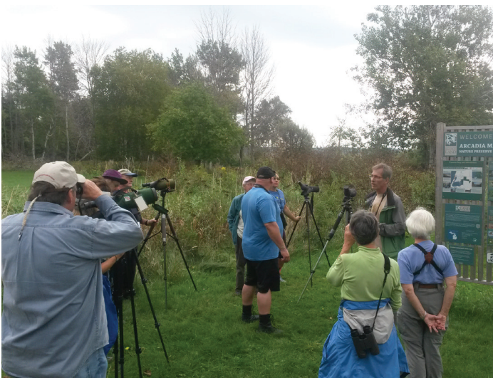
Volunteer lead birding hike at Arcadia Marsh