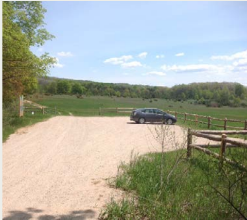
Abby's Woods parking area/trailhead.