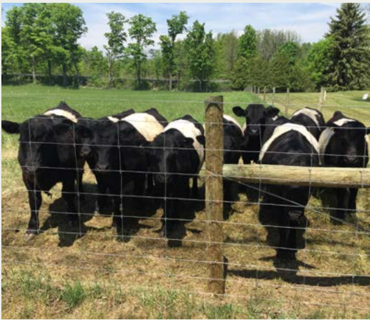
Belted Galloway/angus mix calves.

Volunteers have helped with many tasks on the property including removal of an old barbed wire fence near the parking lot and invasive species control. There are so many things happening at the farm, Vic and Eran are hosting volunteer work days every other Wednesday throughout the summer. Please email Vic Lane (vlane@gtrlc.org) if you'd like to be involved or sign up on the events page .