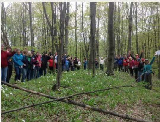
Volunteer led wildflower hike at Arcadia Dunes.