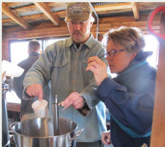
Maple sap testing for sugar density.