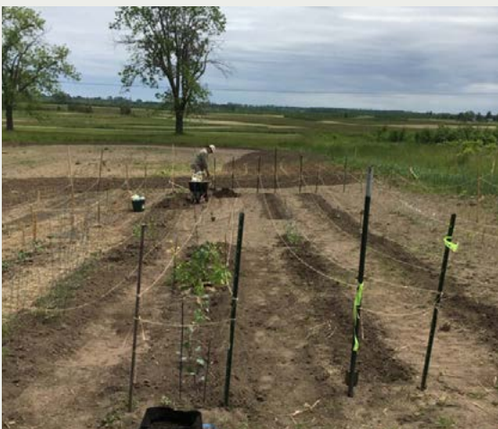
Organic garden preparation and planting.

Plans for the farm house continue to evolve as Vic and architects work through all the technical and code challenges. Splitting the house between residential and business/public use presented some challenges that lead us to focusing on an end use including meeting and office space (not residential). The potential for this space is very exciting and only possible with incredible support from donors and volunteers who have helped stabilize the house and continue to do work on this wonderful old structure.