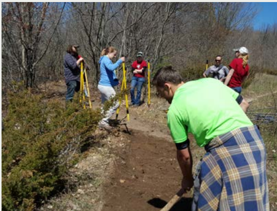
Trail re-route at Arcadia Dunes.