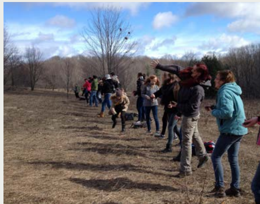
Native seed ball distribution at Timbers Recreation Area.