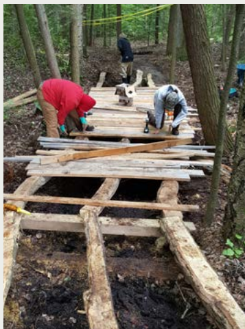
SEEDS crew installing the boardwalk.