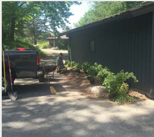
Native plant landscaping installation.