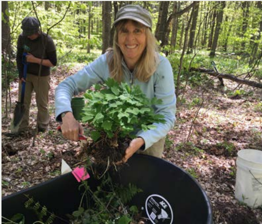
Native plant moving for Universally Accessible trail.