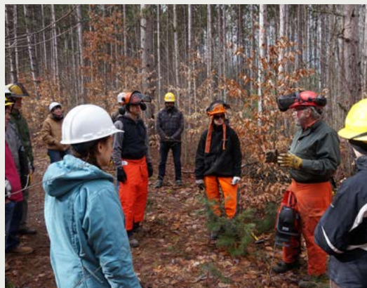
Volunteer chainsaw training.