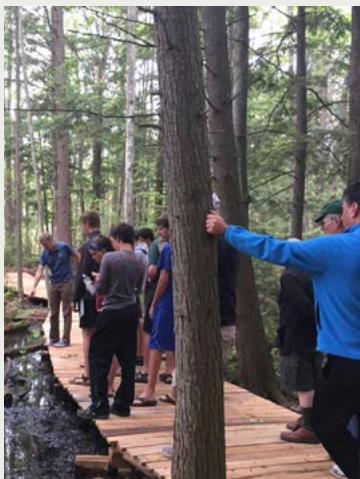
Boyscout group work day.

A group of 18 youth and adults associated with the Boy Scouts are volunteering to help construct a portion of boardwalk and the new kiosk while on a break from their Ludington to Mackinaw bike tour. All construction will be complete in the next few weeks so make sure to stop in and check it out.